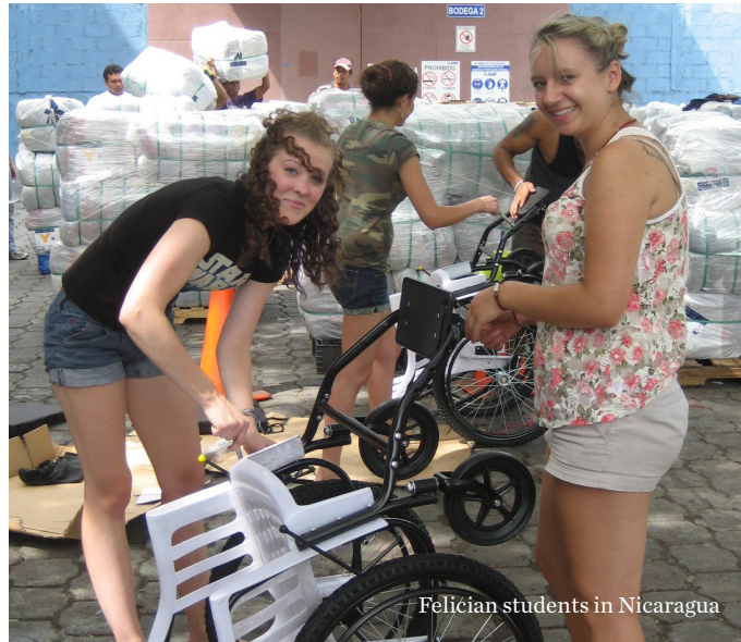
Felician students in Nicaragua

Students are invited to join us for the sixth trip next summer, beginning with registration in the course next spring semester.