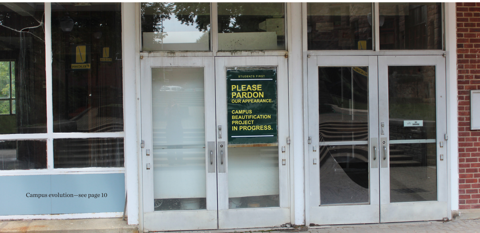
Campus evolution—see page 10