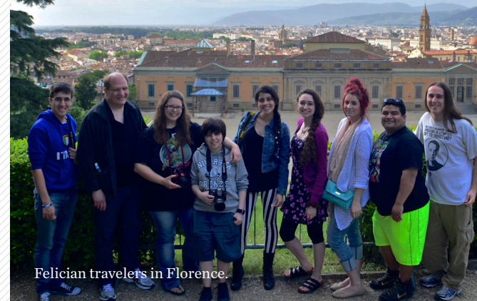
Felician travelers in Florence.