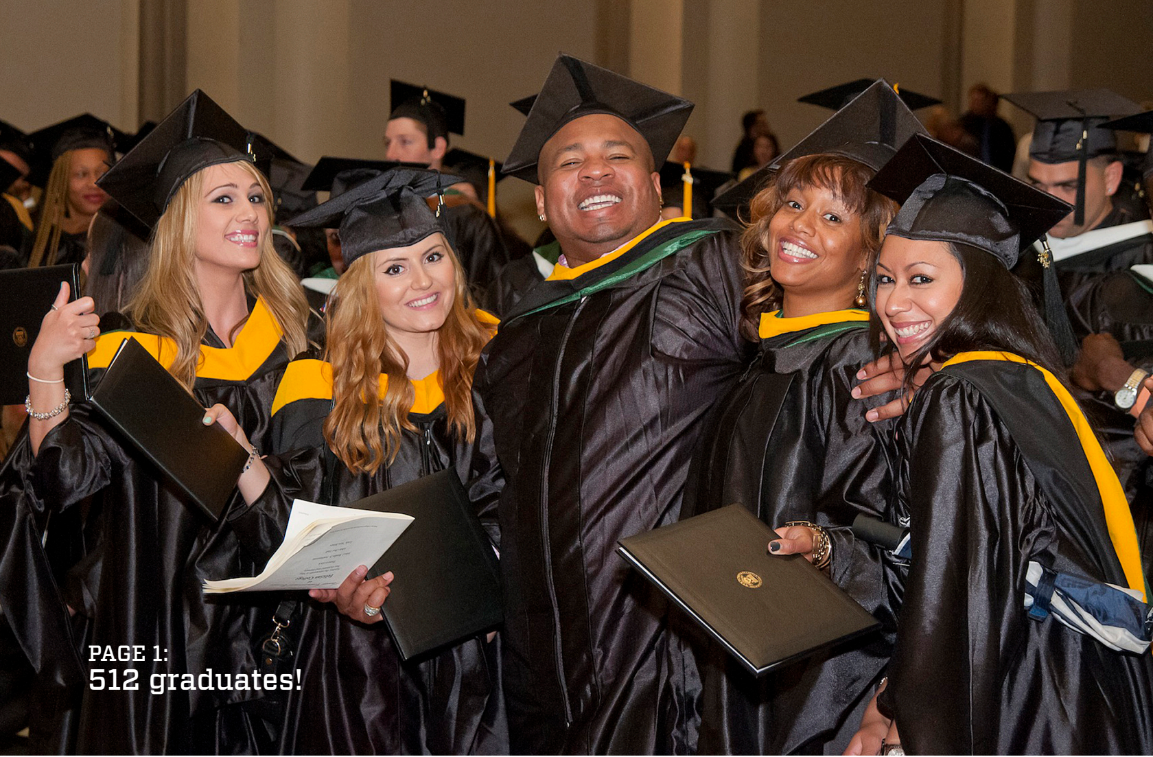
PAGE 1: 512 graduates!