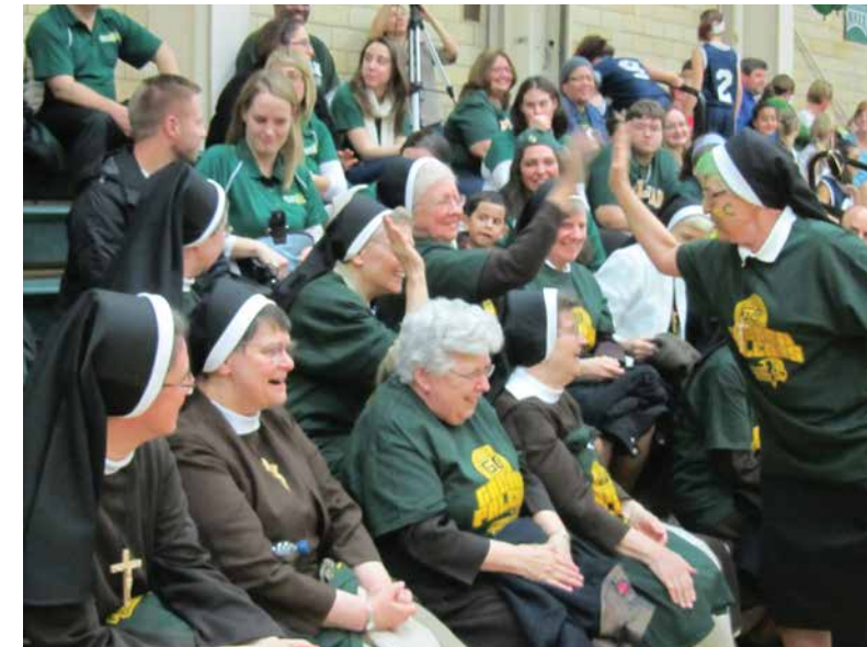
Members of the Felician Student Athlete Advisory Committee collected donations at the door, top; the crowd shows their spirit during the Green Out event, bottom.