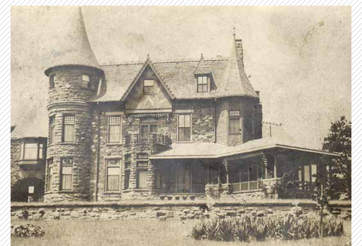
At left, the former music room is now a chapel. Top, replica of a Florentine frieze on the chapel ceiling; the Castle foyer staircase; an early 1900s photo of the Castle.