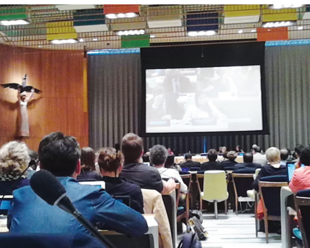
Students in the United Nations Fellowship Program have the opportunity to attend U.N. briefings and to intern with other NGOs and departments within the U.N.

Study alongside other top academic students in high-impact learning environments.